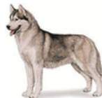
HUSKY BREED S