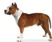
PIT BULL BREEDS